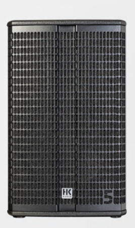
LINEAR 5 MK II 112 FA