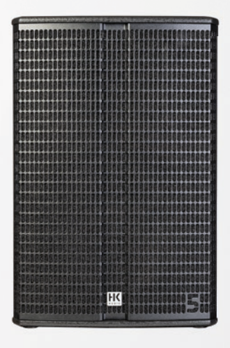
LINEAR 5 MK II 115 XA