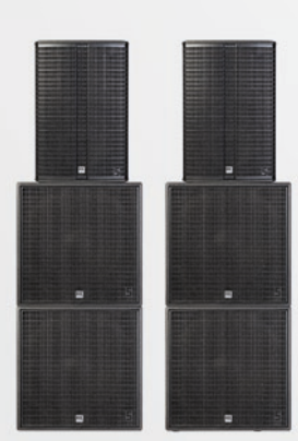
Setup 5: 2x LINEAR 5 MK II 115 FA 4x LINEAR 5 MK II 118 Sub A