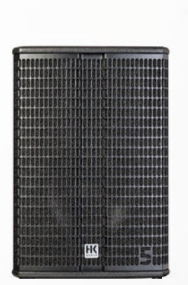
LINEAR 5 MK II 110 XA