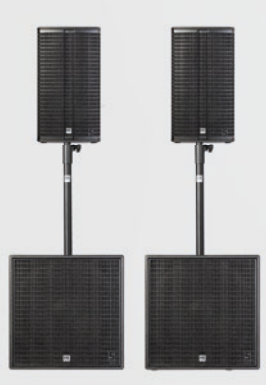
Setup 4: 2x LINEAR 5 MK II 112 XA 2x LINEAR 5 MK II 118 Sub A