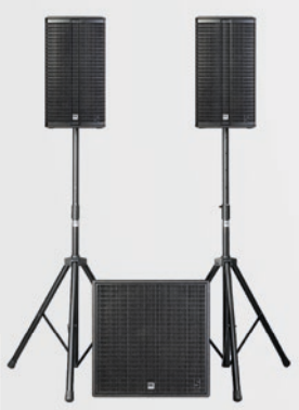
Setup 1: 2x LINEAR 5 мк II 112 FA 1x LINEAR 5 мк II 118 Sub A