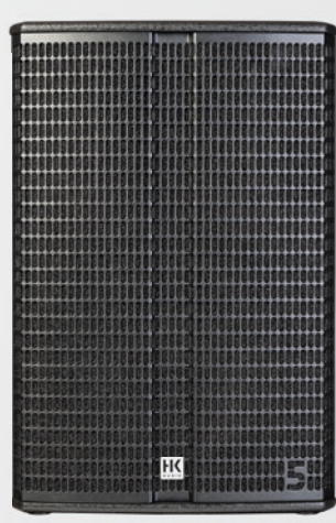
LINEAR 5 MMK II 115 FA